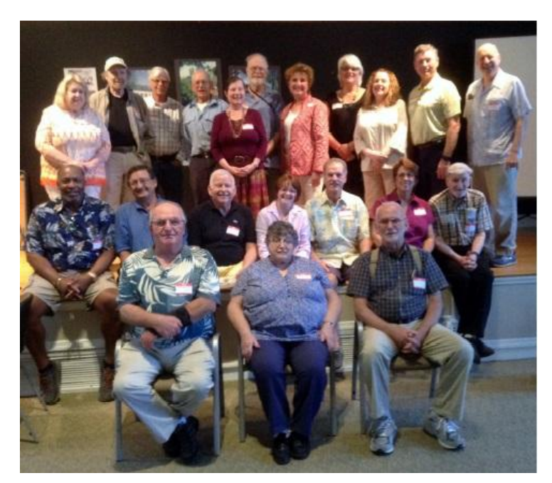
Sorry! Too many to list. 8^(