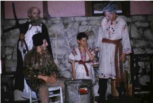
Partial cast of "Martin" with Ivan sitting